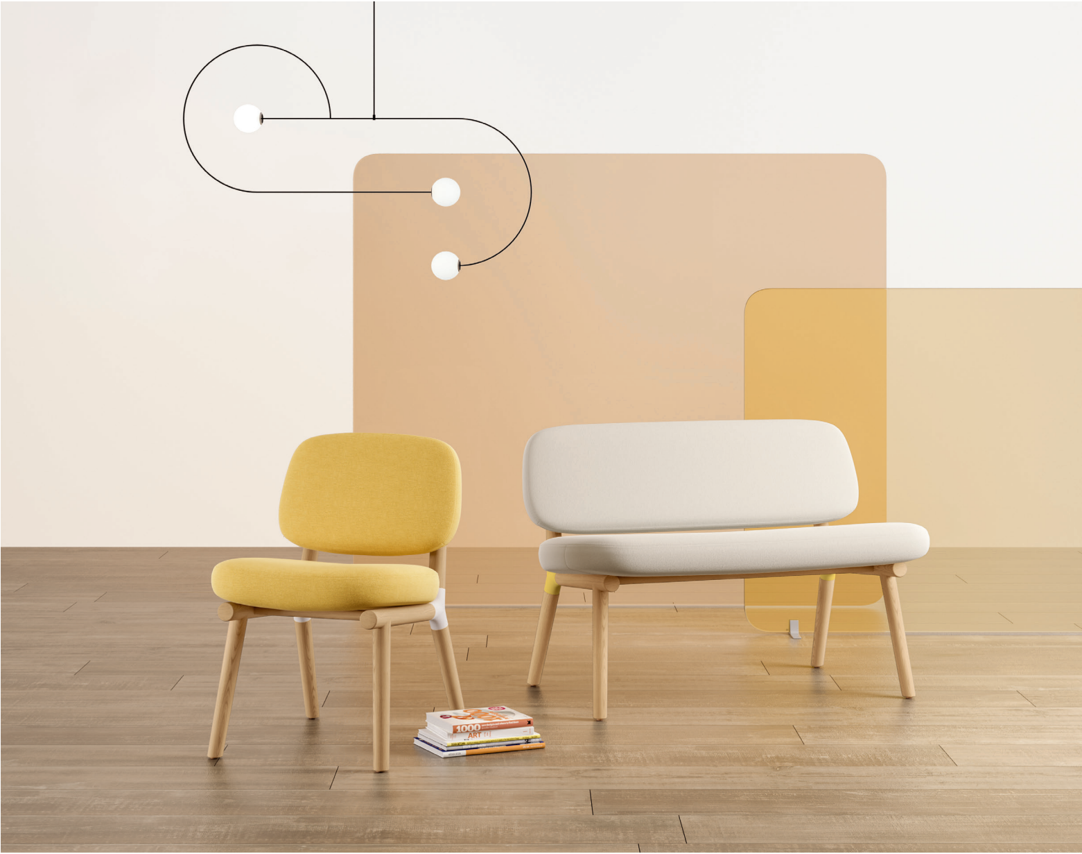
Guest chair and settee.