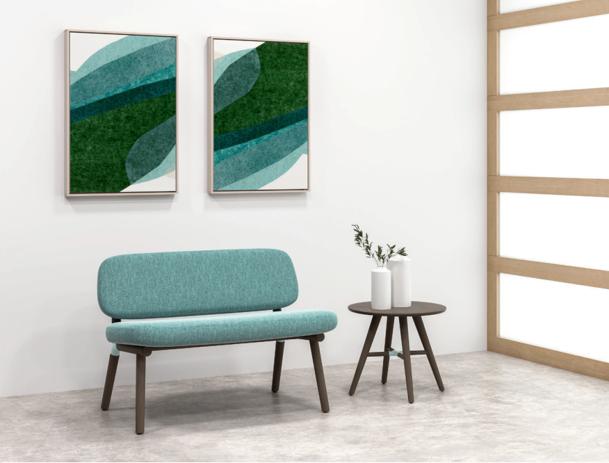
Settee and 20" diameter occasional table.