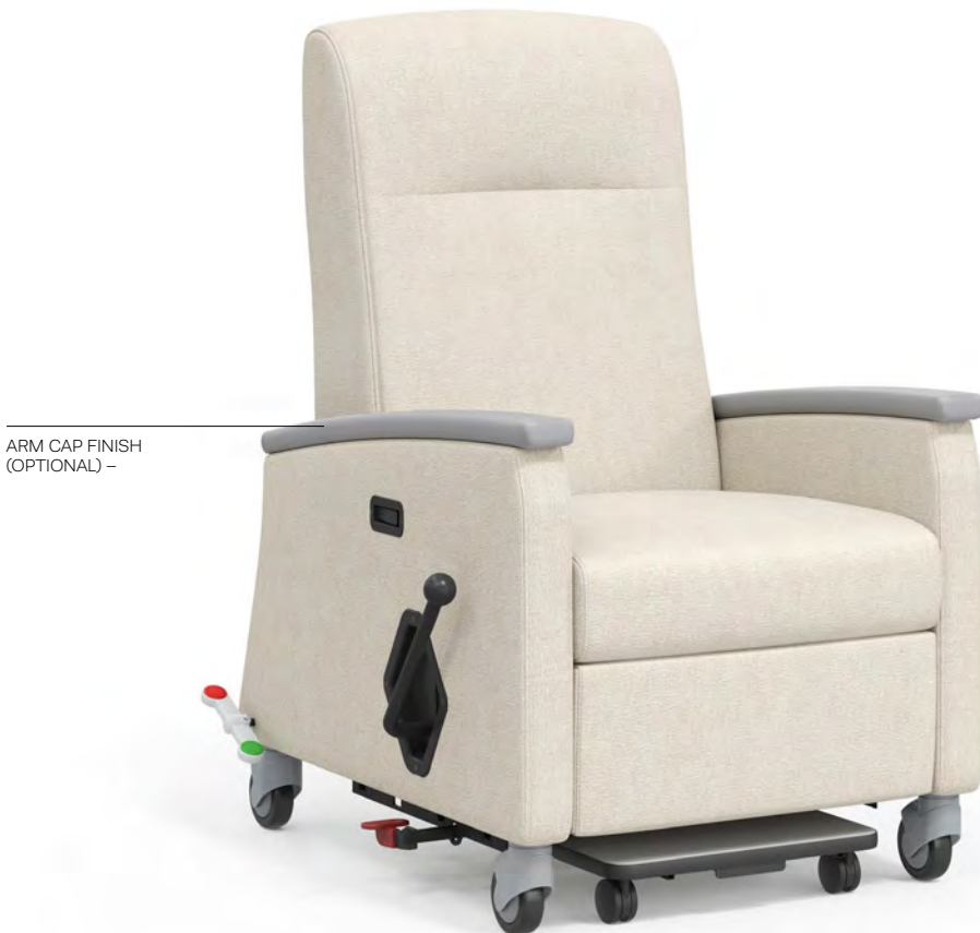
ARM CAP FINISH (OPTIONAL) -