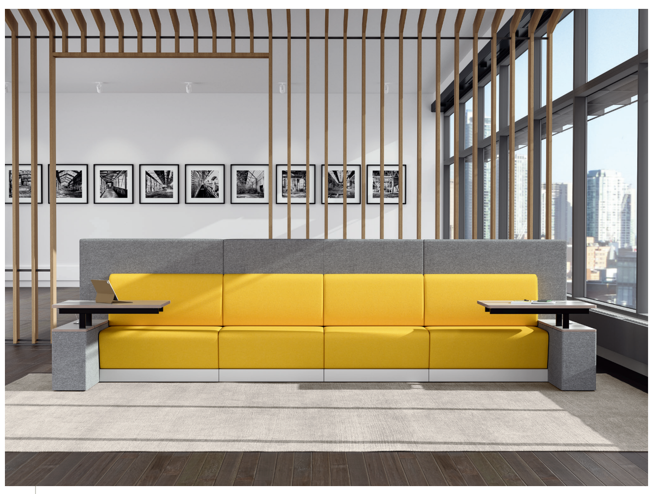
#8616-L and #8617-L 41" W Lounge Units with Tables arranged with #8613-L 72" W Two-Seat Lounge