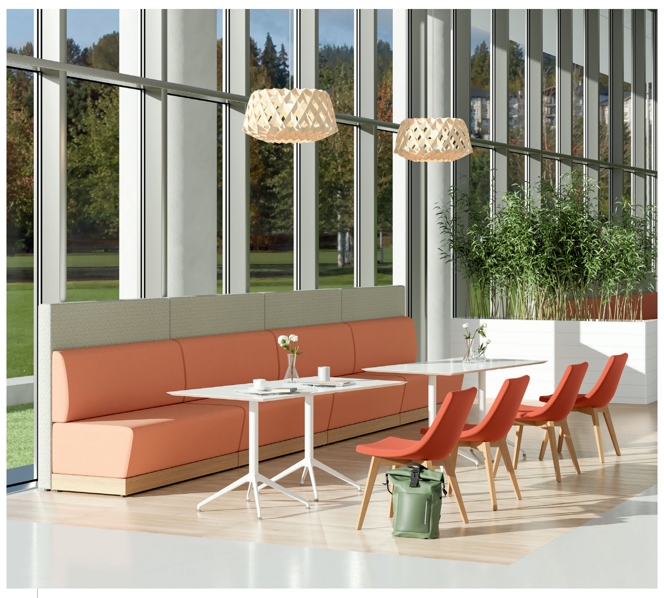
#8612-V 60" W Lounge Models paired with Melina Meeting Tables and Chirp Guest Chairs by Encore