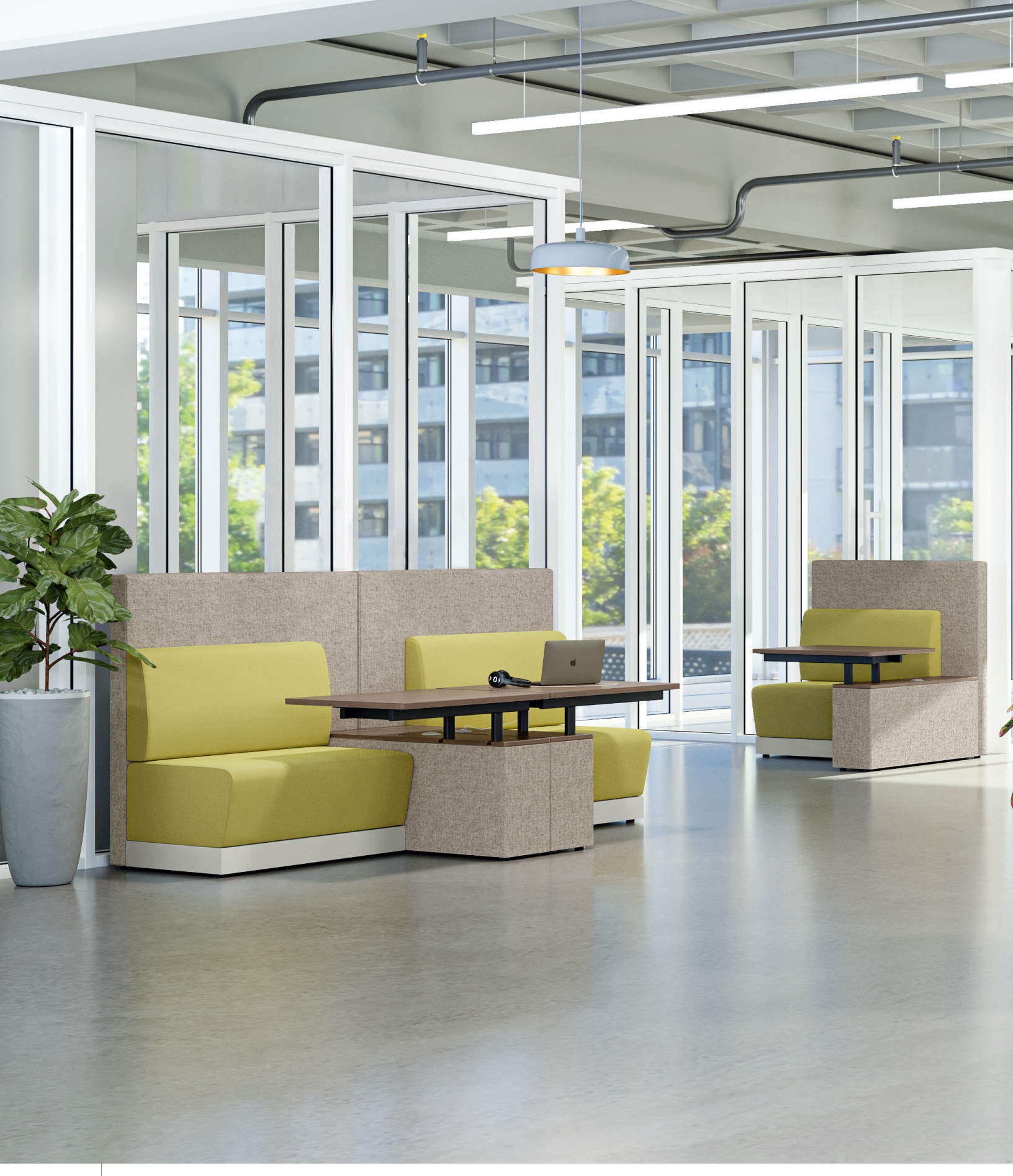
#8616-U and #8617-U 41" W Lounge Units with Tables along with #8620-U Booths