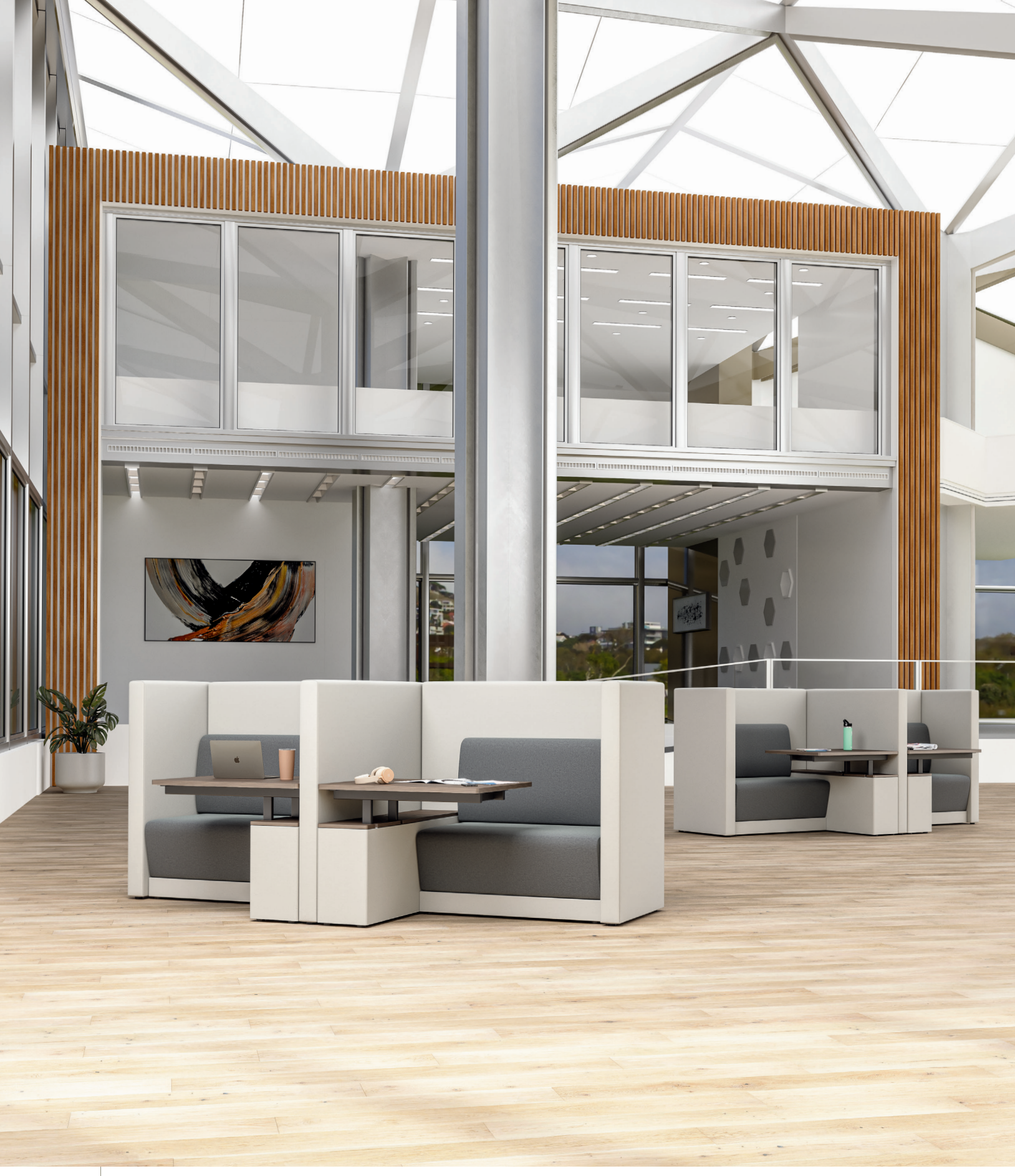
#8616-U and #8617-U 41" W Lounge Units with Tables combined with #86H and #86F Privacy Panels