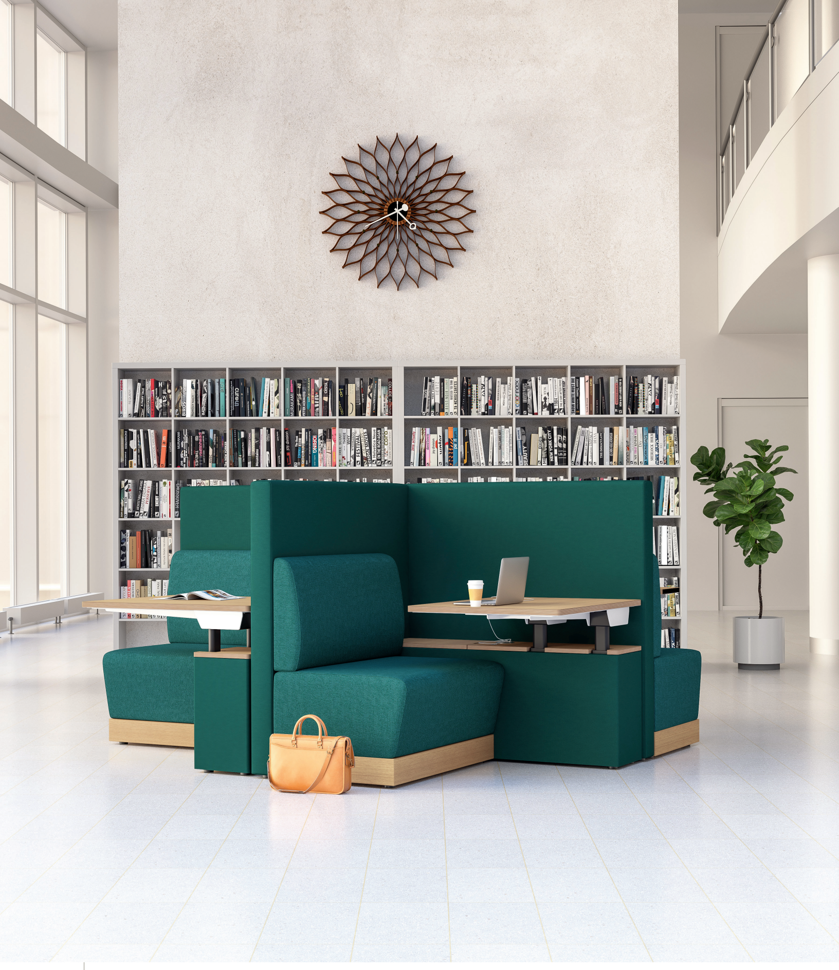
#8615-V-AT01 36" W Lounge Models with Adjustable Height Tables