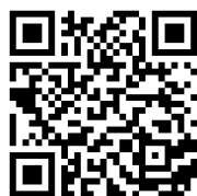
spec it quote builder

Design, quote & view your chair easily using our online configuration tool: viaseating.com/spec-it/splash-air .