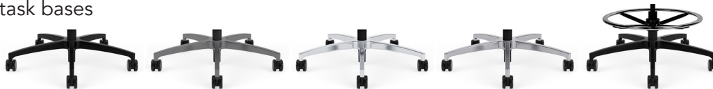
Standard black frame, black nylon 5-star swivel base. Standard grey frame, grey nylon 5-star swivel base. Polished aluminum 5-star swivel base. Brushed aluminum 5-star swivel base. ← Each base can pair with a stool kit/foot ring.