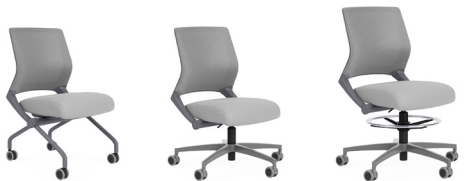
Nesting chair. Light task chair. Light task stool.