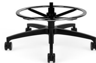
← Each base can pair with a stool kit/foot ring.