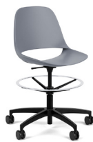
Light task stool.