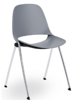
Stackable chair on a v-leg base.