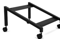
Chair stacking cart. Stacks 15 high.