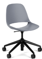
Light task chair.