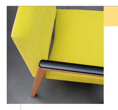
Upkeep is effortless with clean-outs on every side.